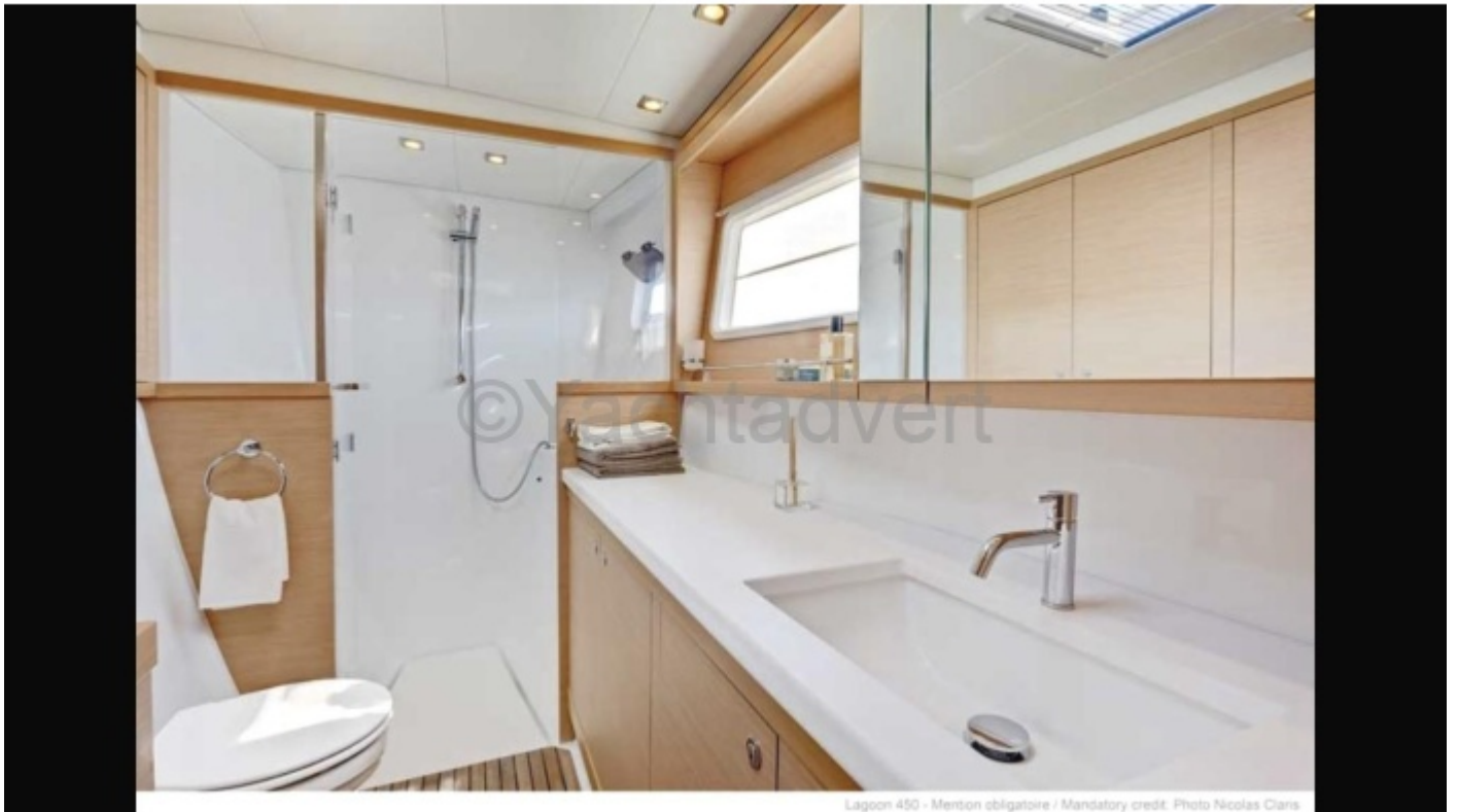
Lagoon 450 - Menton obligatoire / Mandatory credit. Photo Nicolas Clais