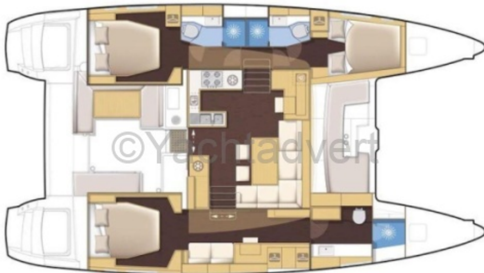
version 3 cabins / 3 cabins version