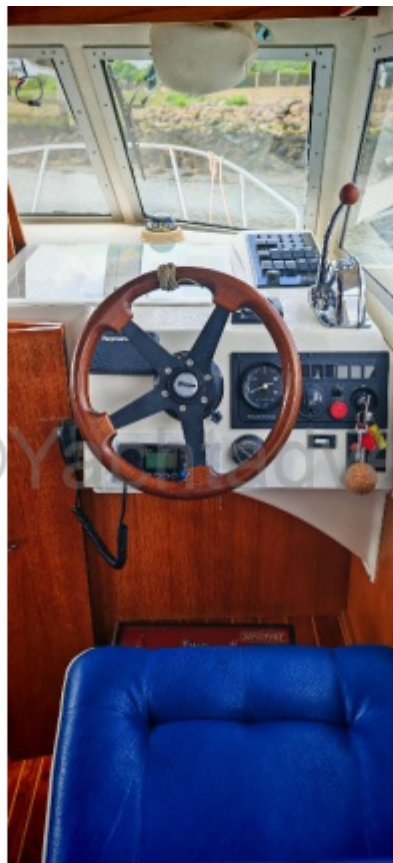
HONOR Magic5 Pro

23 feet 11" x 11'40" x 5'00" www.networkyachtbrokers.com