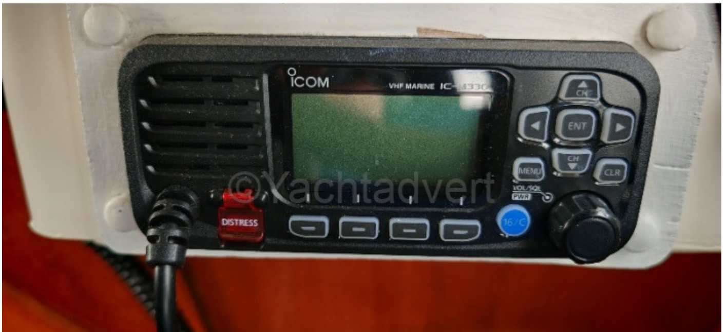
HONOR Magic5 Pro

27mm f/1.6 1/170s ISO50 www.networkvachtbrokers.com