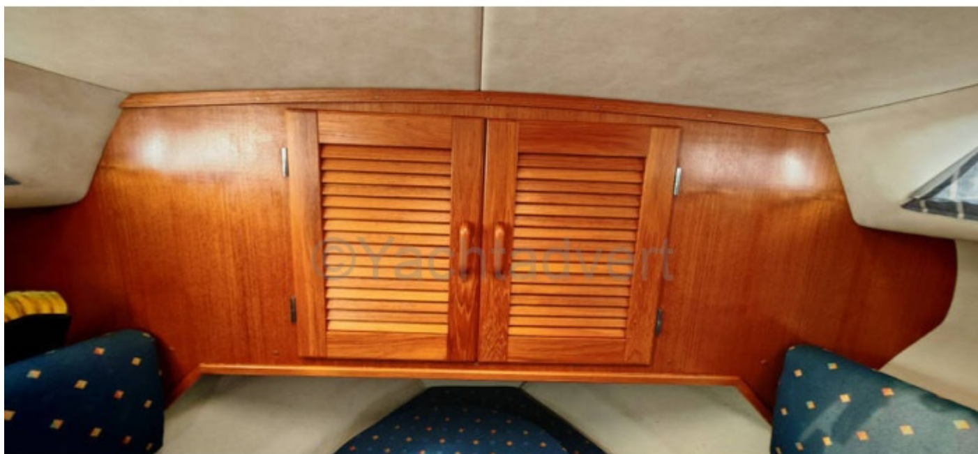
HONOR Magic5 Pro

13mm f/2.1/50s ISO250 www.networkvachtbrokers.com