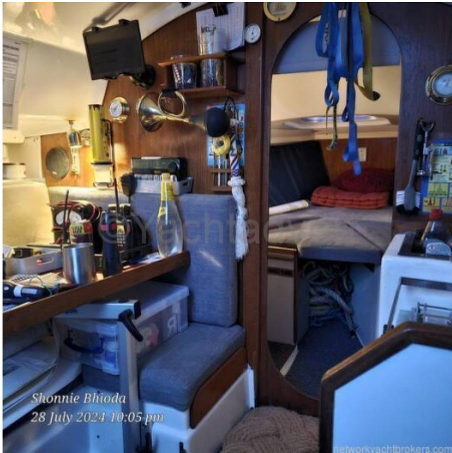
Shonnie Bhioda 28 July 2024 10:05 pm