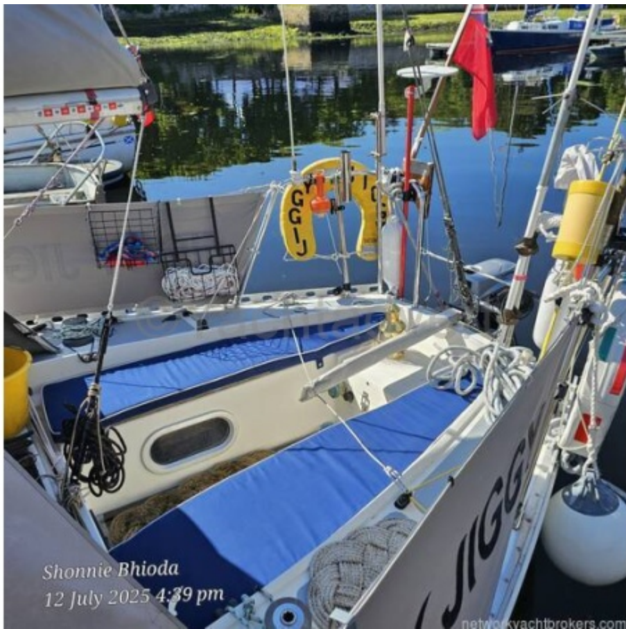
Shonnie Bhioda 12 July 2025 4:39 pm