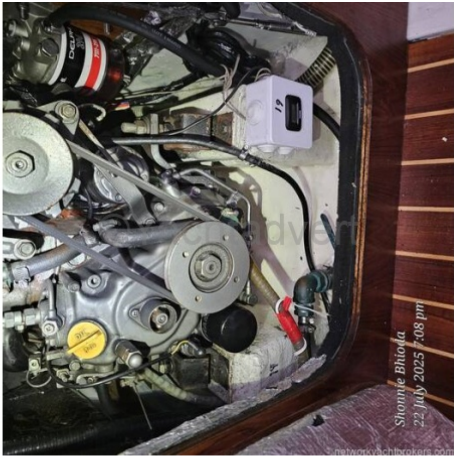
Shonnie Bhioda 22 July 2025 7:08 pm