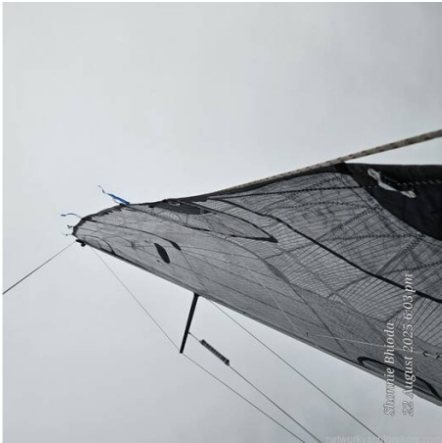
Shonnie Bhioda 22 August 2025 6:03 pm